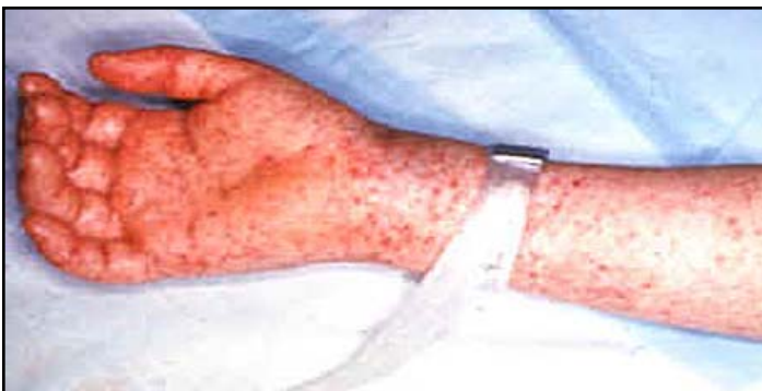
Spotted rash on arm and hand of RMSF patient.

From the third to fifth day of illness a red, spotted rash may appear, beginning on the wrists and ankles. The rash spreads quickly to the palms of the hands and soles of the feet and then to the rest of the body. However, only about half of RMSF patients develop a rash.