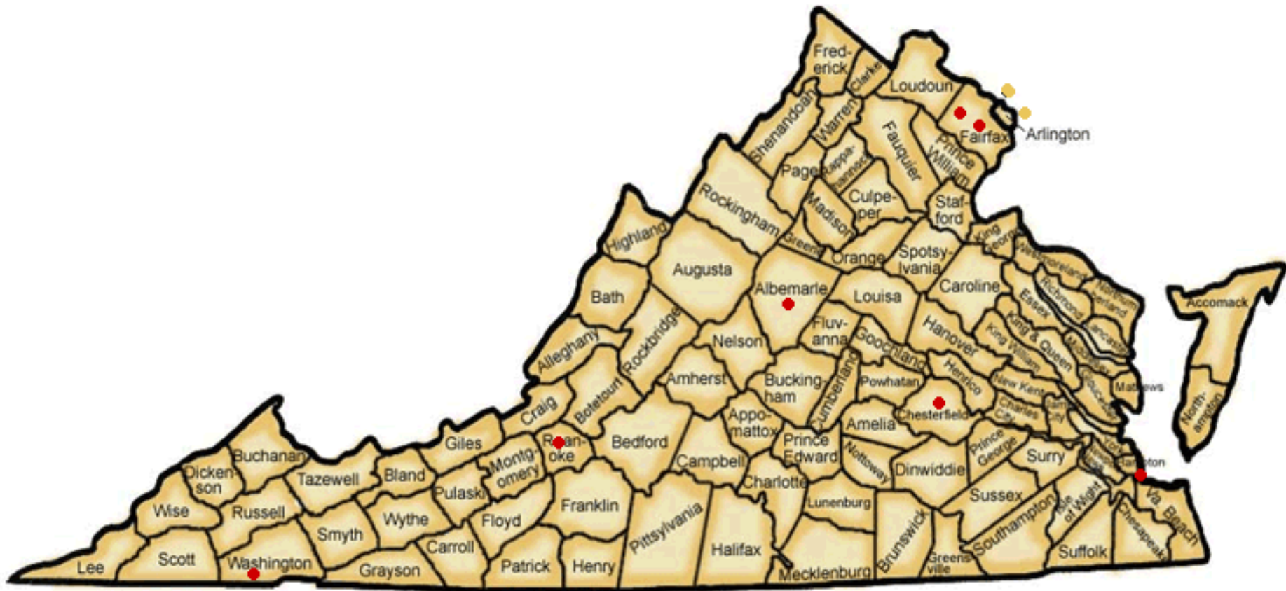
Air Medical Services in Virginia - An Overview