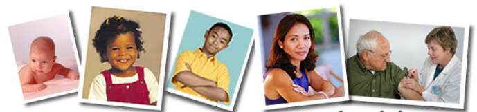
immunization through the years

If you are interested in ordering immunization materials, CDC's publication order system is now up and running. To order materials, please visit www.cdc.gov/vaccines/pubs/default.htm . The order form is located at the bottom of the webpage. Materials currently available include immunization schedules, CD's, DVD's, and annual reports. More items are expected to be available in the near future.