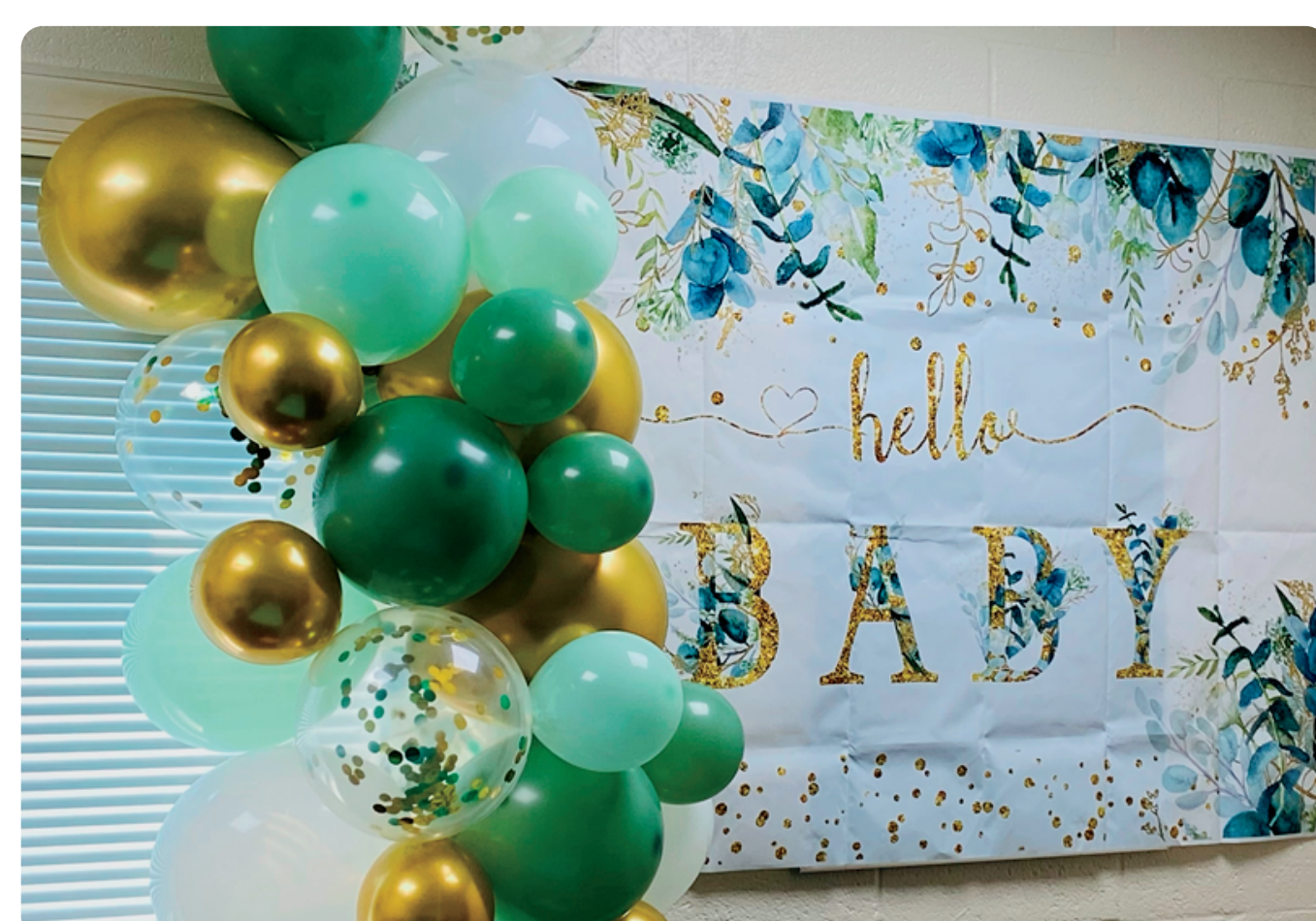
Baby Shower for a PWHD Staff Member