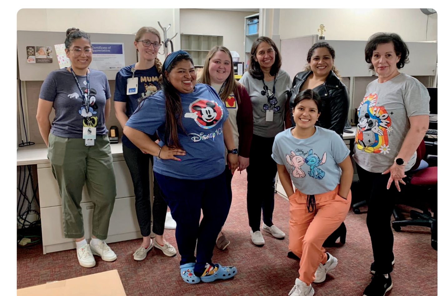
PWHD Manassas Office Staff