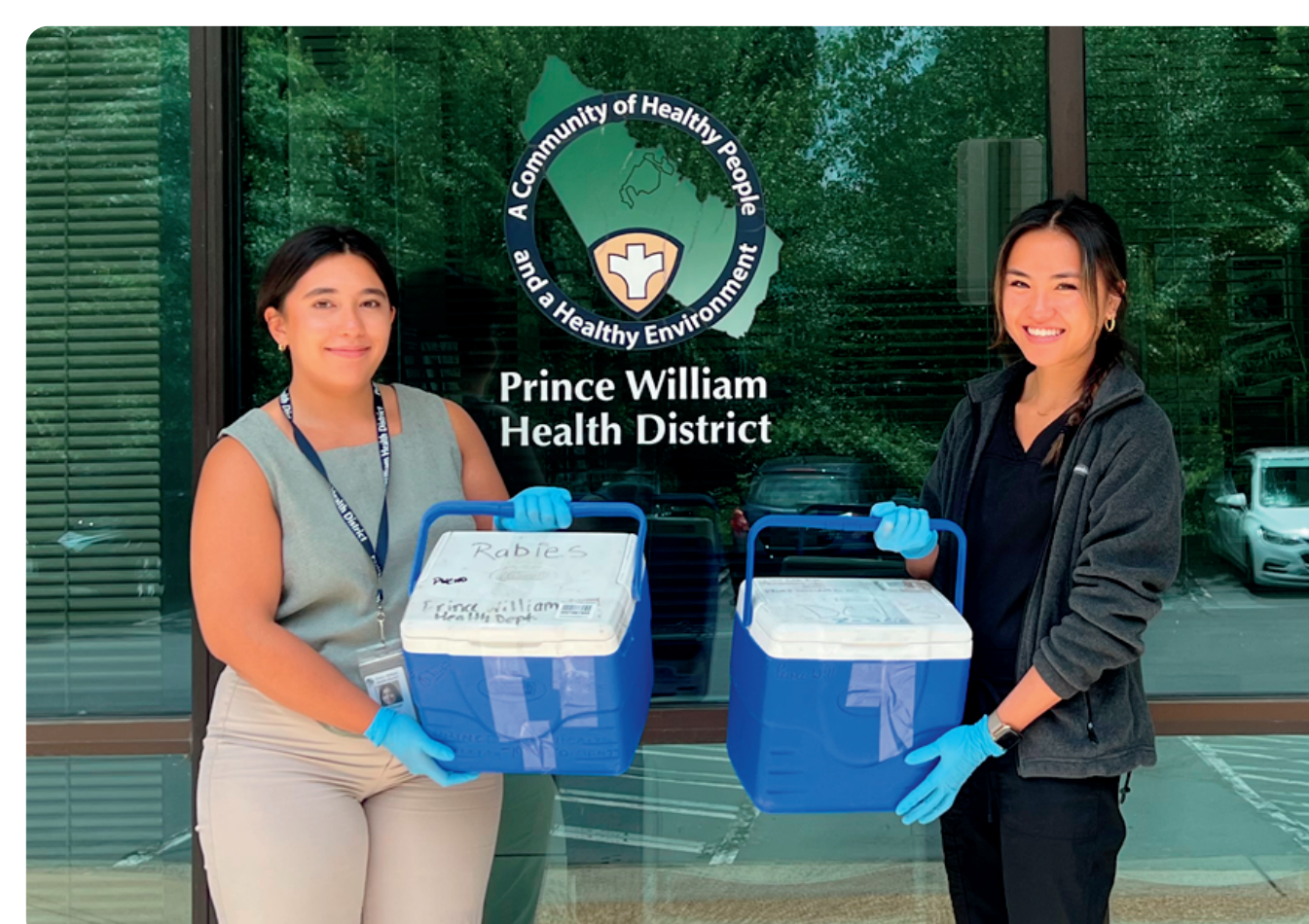
Preparing Rabies Specimen for Testing