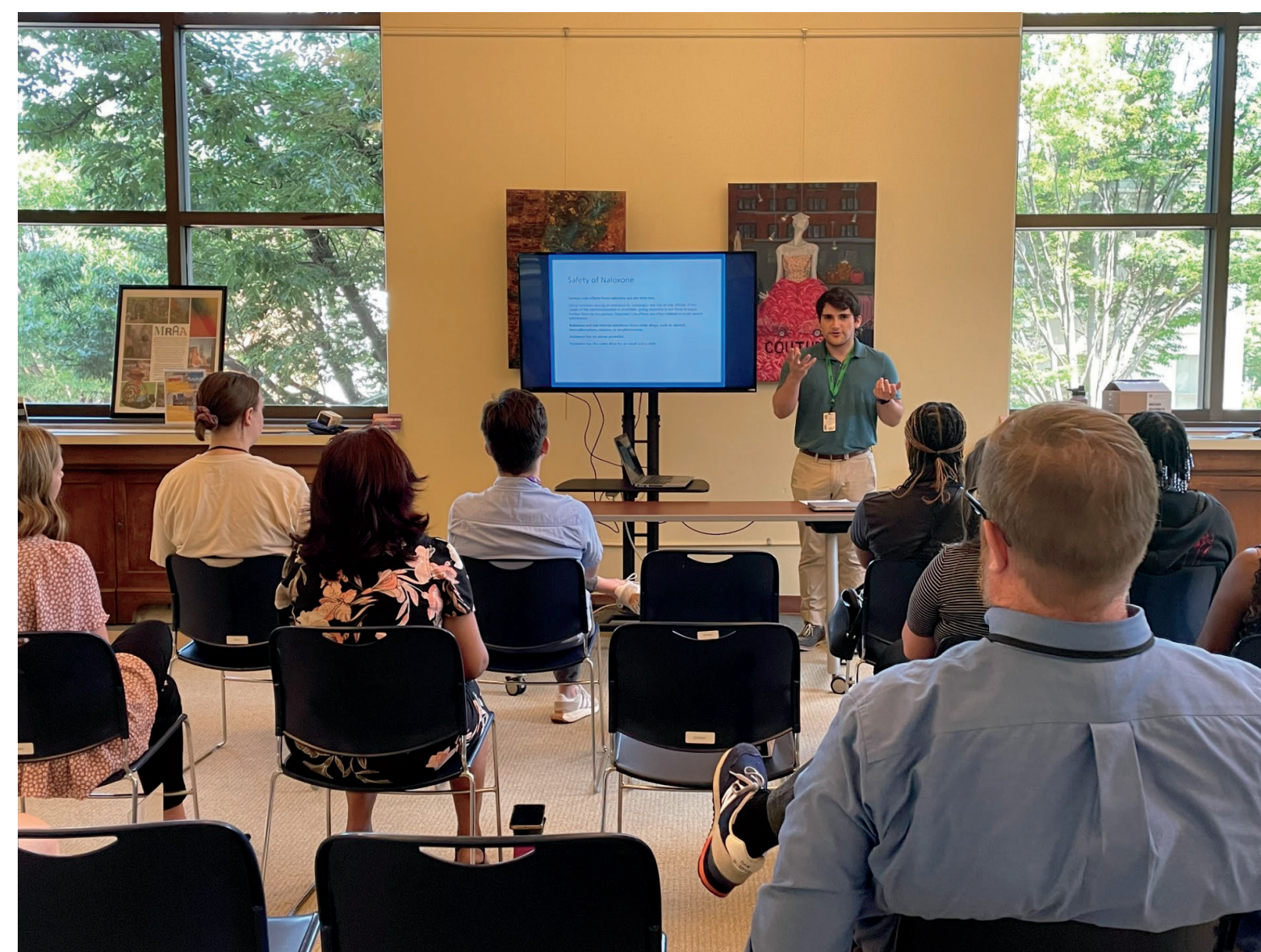
Training staff at the Richmond Main Library!