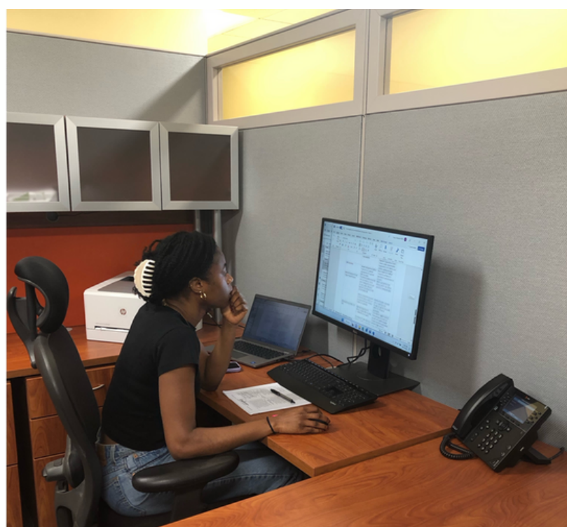
IN THE OFFICE