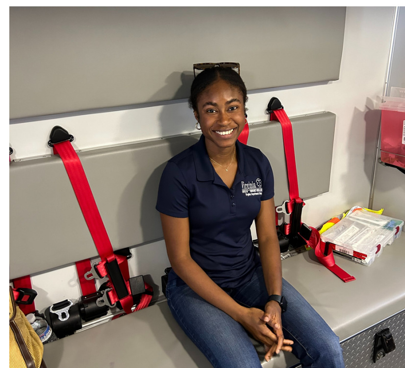
RAA RIDE ALONG