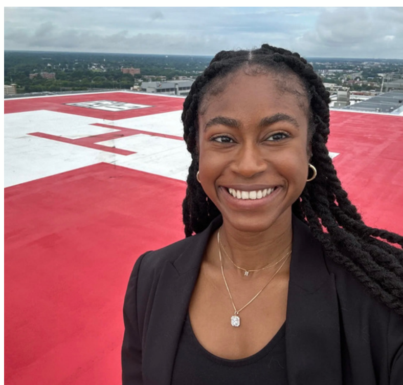
ON THE HELIPAD