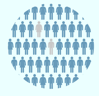
1 or 2 out of 1,000 people with measles will die, even with the best care.