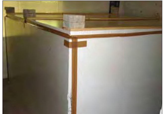
University of Florida Cooperative Extension