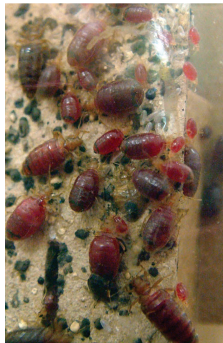
Fed bed bugs

The lifecycle data presented in this publication is based on research conducted using bed bugs collected from apartments within the state of Virginia. These populations have documented resistance to pyrethroid insecticides. Laboratory studies have indicated that resistant bed bugs have a shorter developmental time (several days), shorter life spans and lower levels of egg production than bed bugs that are not resistant to insecticides. At the time of this writing, practically all "natural" bed bug populations collected in Virginia have been found to be at least somewhat resistant to pyrethroid insecticides.