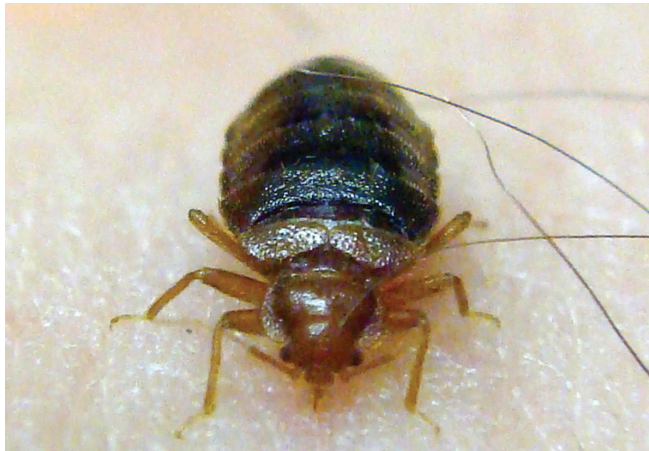
Bed bug feeding

when the human host is typically in their deepest sleep, that bed bugs like to feed.