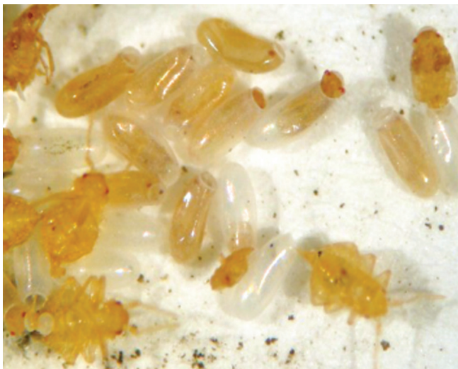
Bed bug eggs hatching