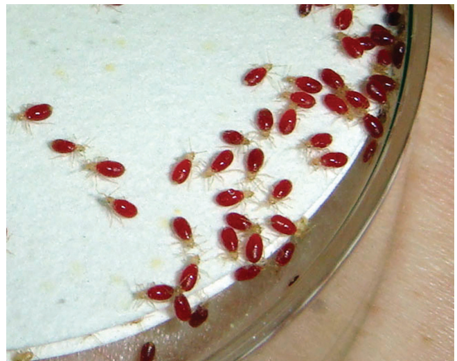
First instars after feeding

Even under the best conditions some bed bug nymphs will die prior to becoming adults. The first instars are particularly vulnerable. Newly hatched nymphs are