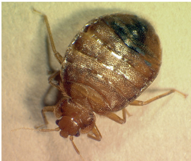
Unfed or starved adult bed bug

A recent laboratory study has shown that starvation can greatly reduce bed bug survival. This modern study