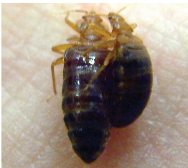
Bed bugs mating

In practical terms, this means that a single mated female brought into a home can cause an infestation without having a male present, as long as she has access to regular blood meals. The female will eventually run out of sperm, and will have to mate again to fertilize her eggs. However, she can easily mate with her own offspring after they become adults to continue the infestation.