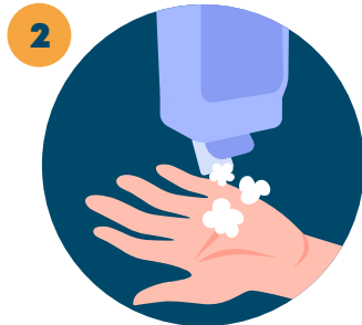
Apply soap on the palm of the hand.