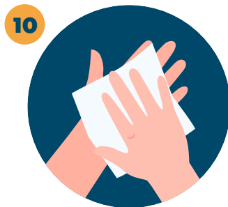
Dry with a single towel.