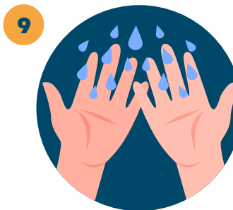
Rinse hands with water.