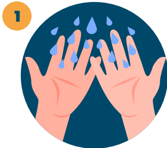
Wet your hands with water.

Practicing hand hygiene, which includes hand washing with soap and water for at least 20 seconds or using alcohol-based disinfectant, are simple and effective ways to prevent the spread of germs and infections in healthcare settings.