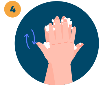
Lather the back of both hands.