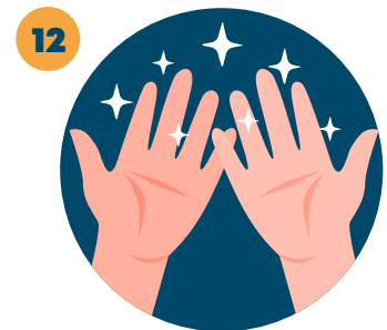
Your hands are clean.