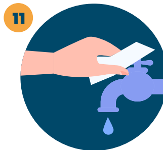
Use the towel to turn off the faucet.