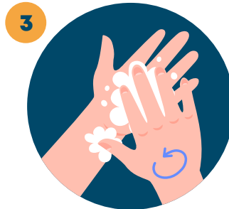
Rub hands palm to palm.