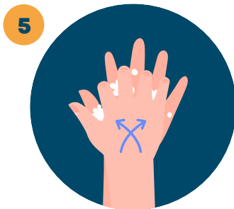
Scrub between your fingers.