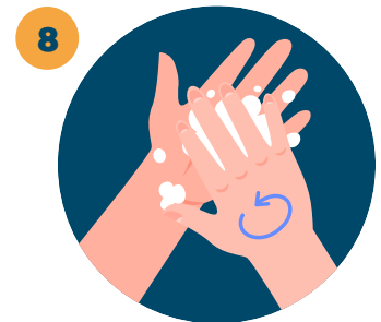
Wash fingernails and fingertips.