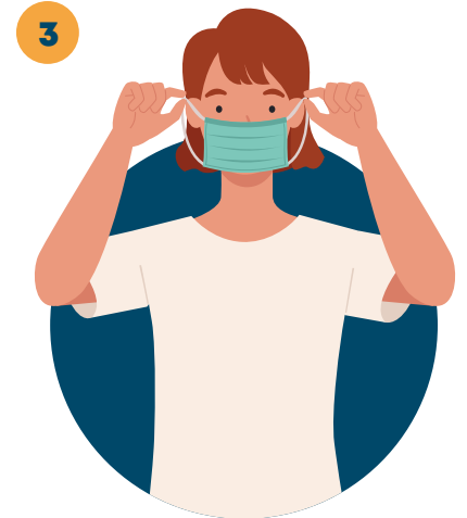
3 Secure strings or elastic around your ears or behind your head so that mask fits your face without any gaps.