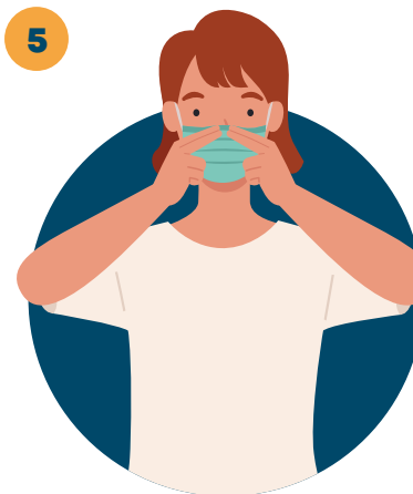
5 Bend nose fitting the shape of your nose (if your mask has one). Make sure you can breath easily.