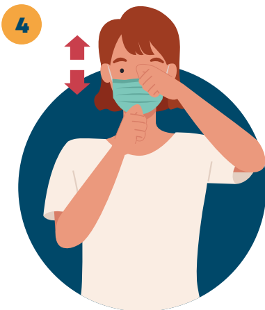
4 Ensure that the mask covers your nose and chin.