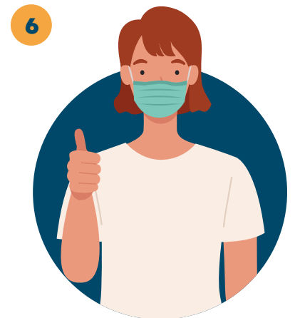
6 Don't touch the mask while you are wearing it. If you do, wash your hands with soap and water or disinfect them.