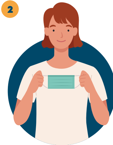
2 Make sure that the mask is right side out with the part intended for your nose on the top.