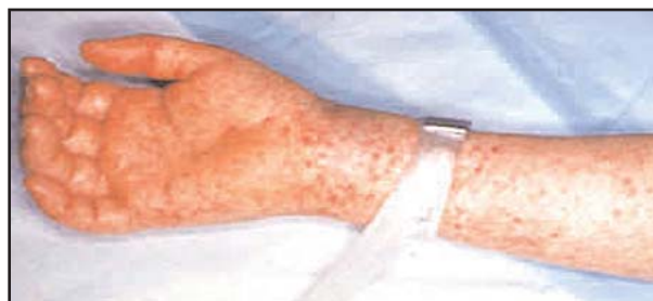
Spotted rash on arm and hand of RMSF patient.

In Virginia, the American dog tick ( Dermacentor variabilis ) is the species thought to carry the agent of RMSF. The tick needs to feed on a host/person for about 10 to 20 hours to transmit the bacteria. Fortunately, fewer than one in a thousand American dog ticks carries the agent of RMSF.