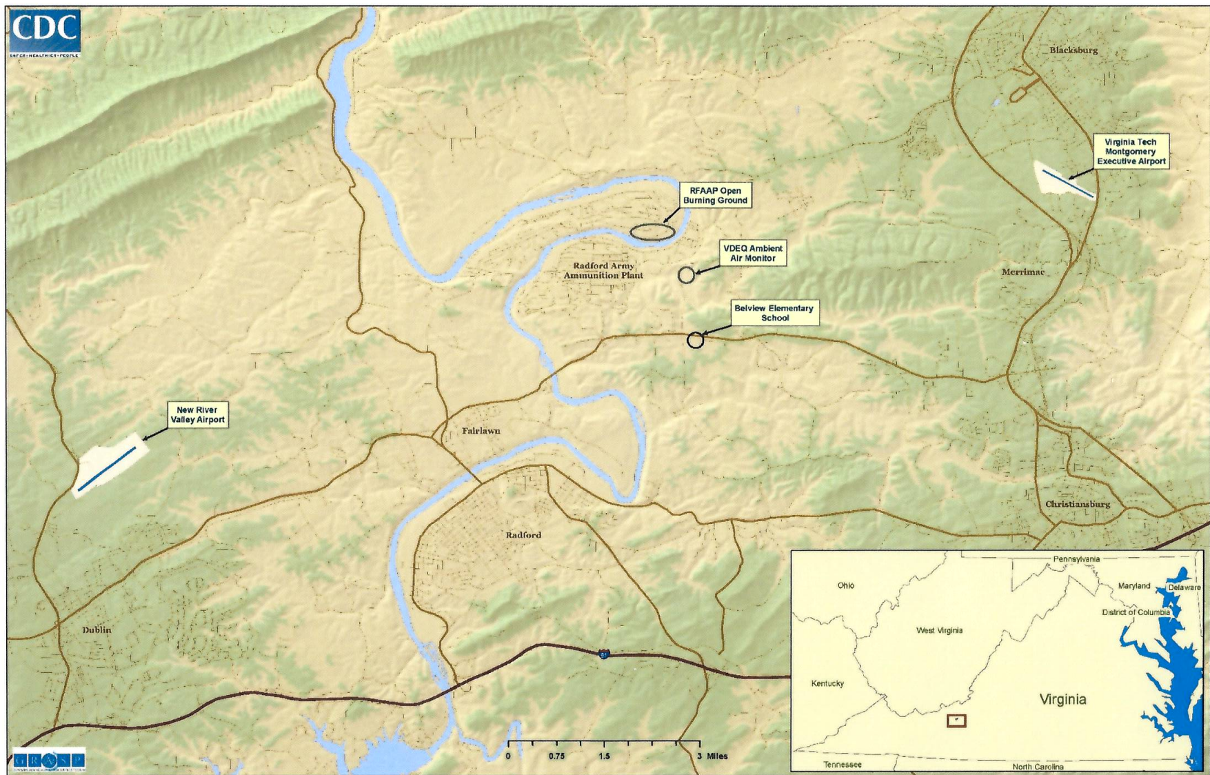
Figure 1. Map showing location of RFAAP open burning ground in relation to VDEQ air monitors, nearest school, and two regional airports