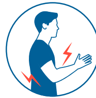
Muscle aches and back aches