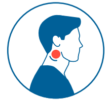
Swollen lymph nodes

The health department will give you directions about how to monitor your health and will talk with you each day. You may continue your normal activities during this time if you do not have any symptoms.