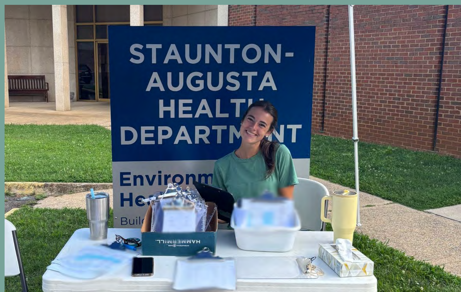
Assisting at the Staunton drive through Farmers Market