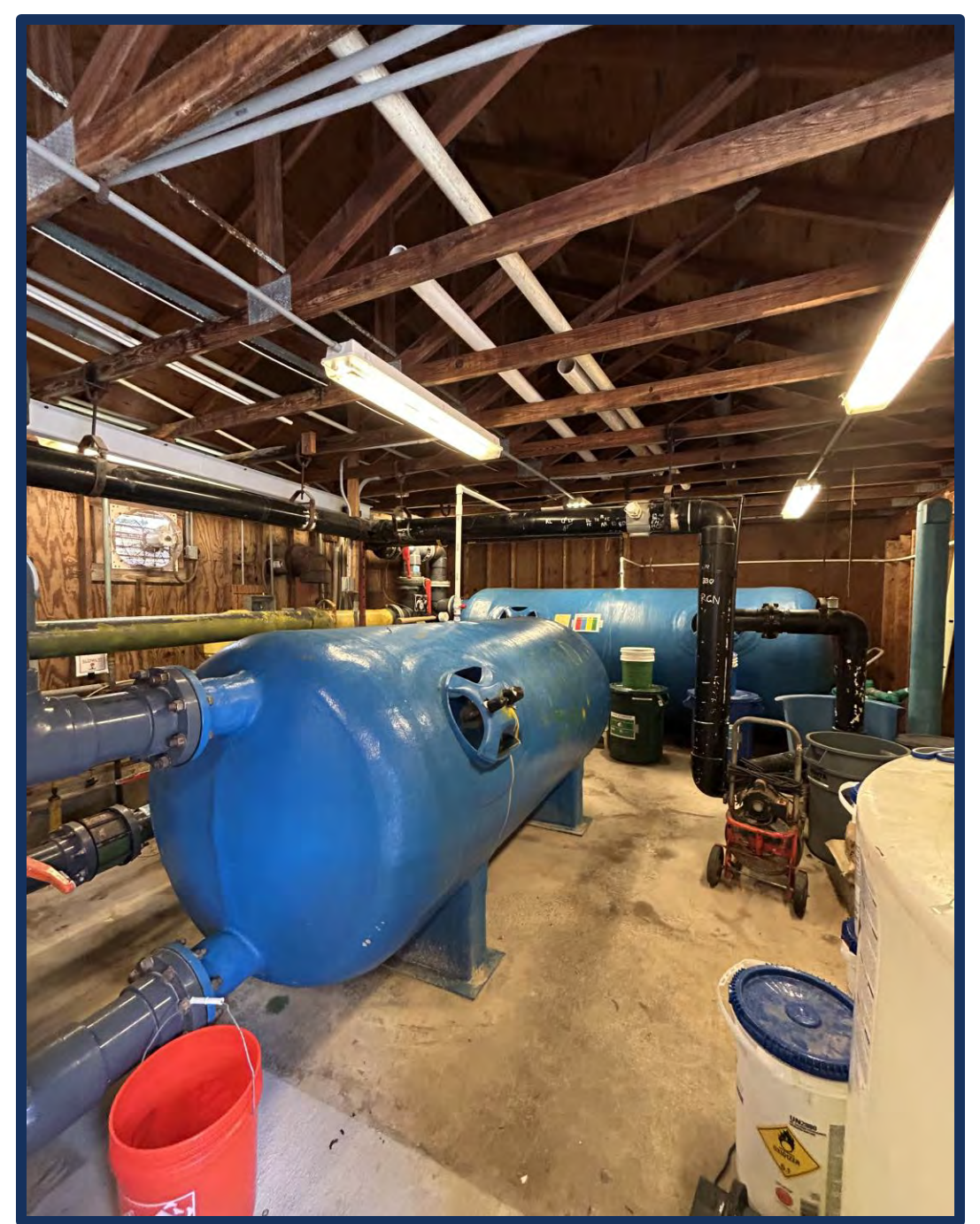
Pumps for a neighborhood main pool, wading pool, and waterpark (left to right) that I observed inspections at.