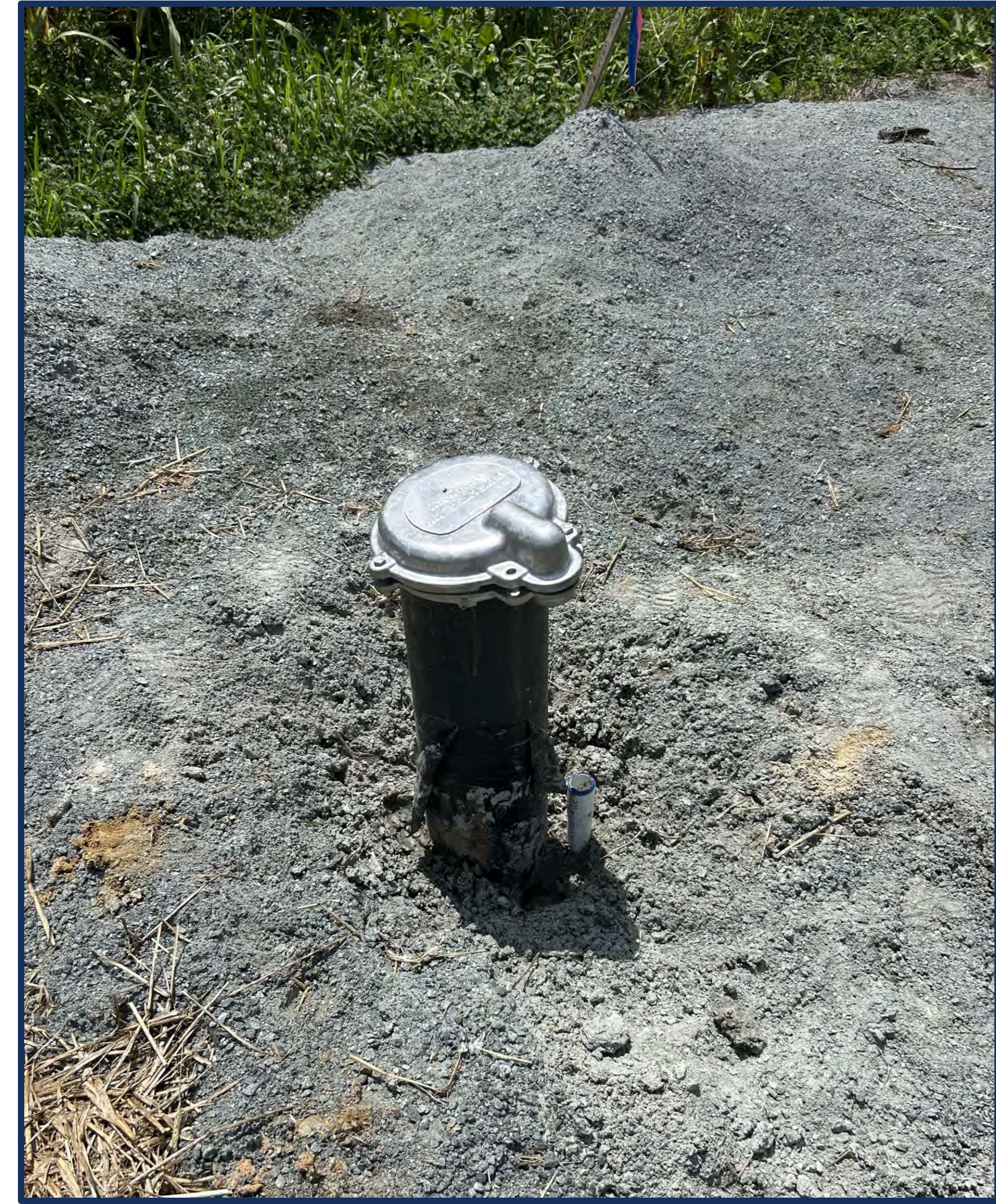
A recently completed private well that I observed an inspection of.