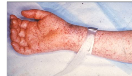
Spotted Fever Rash caused by RMSF

Rocky Mountain Spotted Fever: RMSF is a very serious illness caused by the bacteria Rickettsia rickettsii and is characterized by a sudden onset of fever 2-14 days after an infectious tick bite. The fever may be accompanied by headache, muscle pain, nausea, vomiting, abdominal pain, and a red spotted rash. The rash typically appears 2 to 4 days after onset of illness, beginning at the wrists and ankles and spreading to the palms, soles of feet, and the rest of the body. Appropriate antibiotic treatment (doxycycline) should begin as soon as RMSF is suspected; delay of treatment may result in a severe illness, resulting in permanent damage to organs and limbs or a fatal outcome. Testing is best done in samples submitted through the Virginia DCLS.