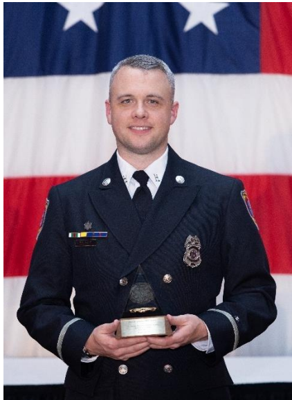
Commonwealth of Virginia.