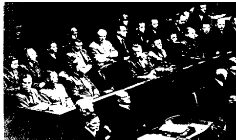
Nuremberg Doctor's Trial