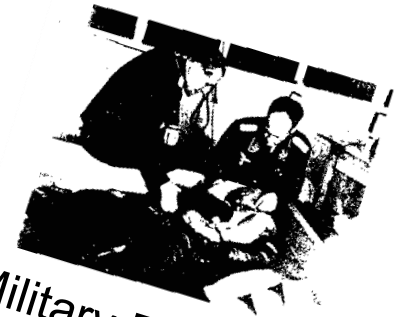
Nazi Military Experiments