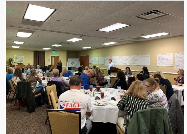
Photo: Community Conversation in Bluefield, VA