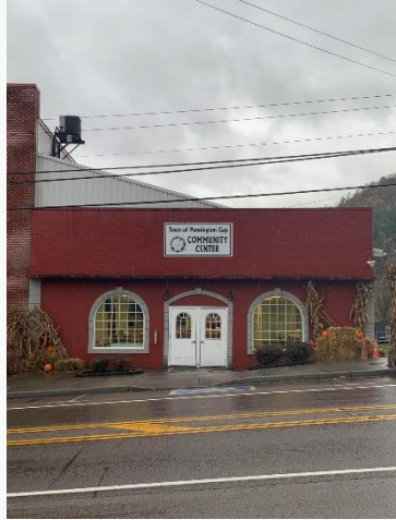
Photo: Community Conversation site in Pennington Gap, VA