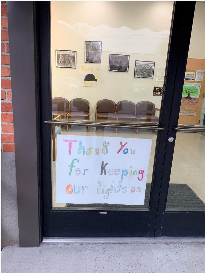
Photo: Stone Mountain Health Services Black Lung Clinic St. Charles, VA