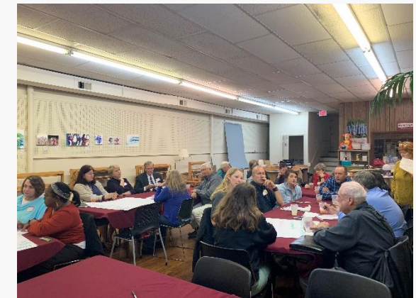
Photo: Community Conversation in Stuart, VA

To lift the voice of community health and rural prosperity