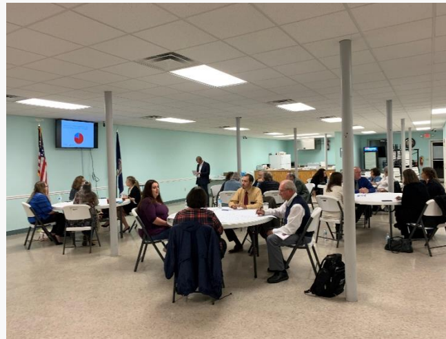
Photo: Community Conversation in Pennington Gap, VA

Our hope is that when we leave the conversation, we learn what is important to the community, what are the important issues, and what type of tools we need to share or create to help lift communities.