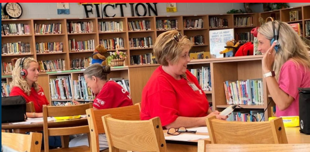
Hearing Screenings for Washington Co. Public Schools