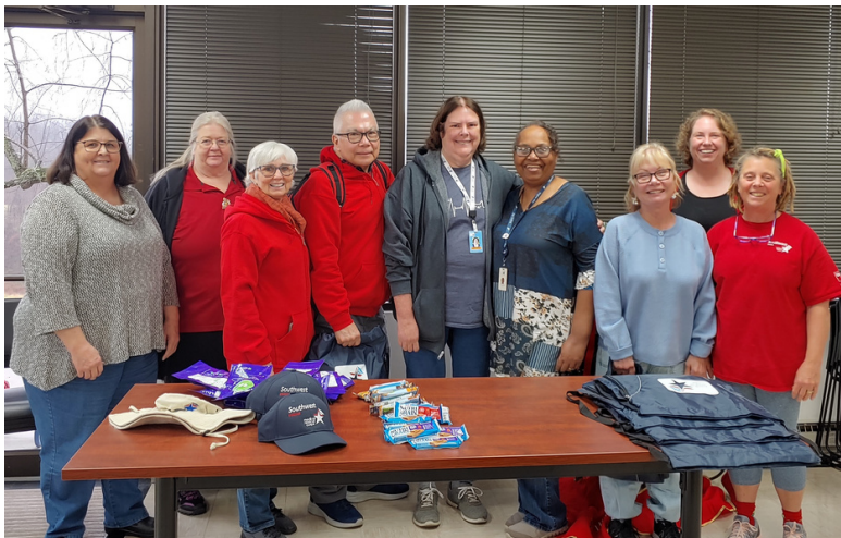
Some of the SWVA MRC REVIVE! trainers!

The issues of substance misuse and addiction continue to be source of work for SWVA MRC volunteers. Drug Take Back in the spring and fall led to the collection of over 3900 pounds of medications for disposal.