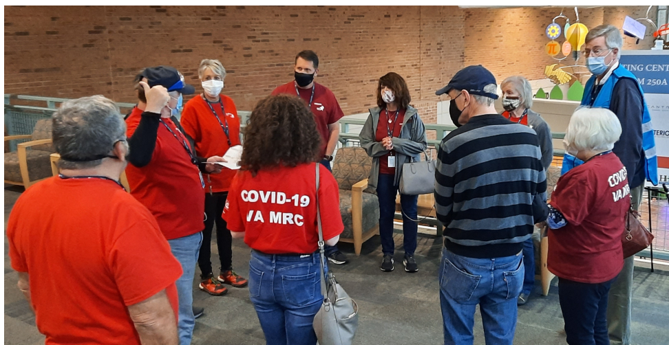
Volunteers getting ready at Higher Ed Center Mass Vaccination event

While each person acknowledges 2020 was a trying year, 2021 brought about a whole new set of challenges and opportunities for the Medical Reserve Corps. MRC volunteers spent the entirety of 2021 stepping up to help support public health in every way possible: serving at COVID-19 vaccination clinics, contact tracing, helping at Drug Take Back, school flu clinics, couriers to COVID patients in quarantine, packaging more than 4,800 infection prevention supplies for school children, COVID screening at health departments, taking REVIVE! and CPR courses, and more!