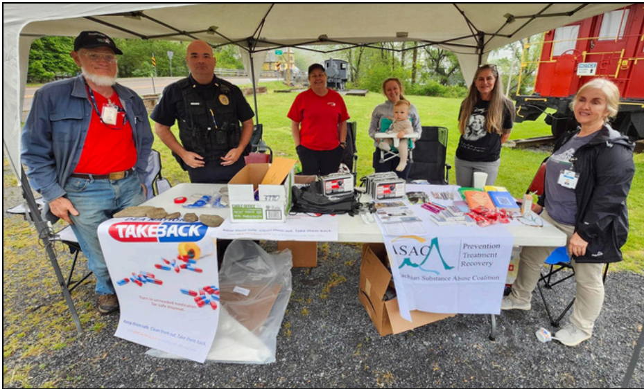
Volunteers at the Damascus Caboose.

Drug Take Back helps to keep drugs from ending up in the wrong hands or from causing environmental contamination by people flushing pills or throwing them in the trash.