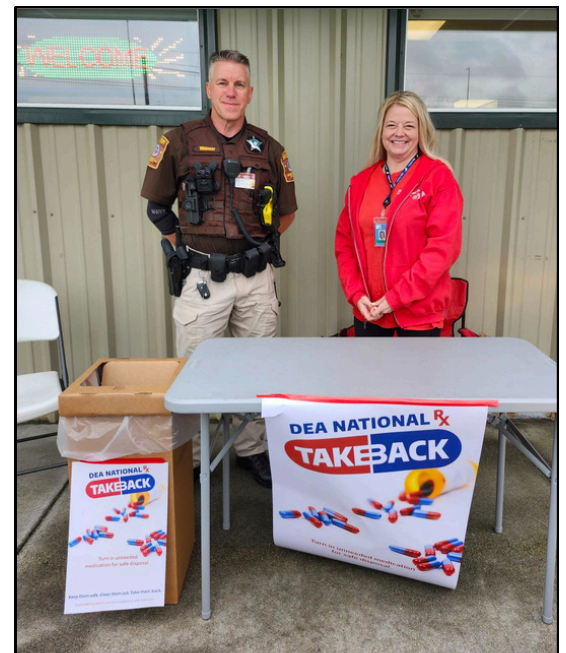
Drug Take Back at Michael's Pharmacy.