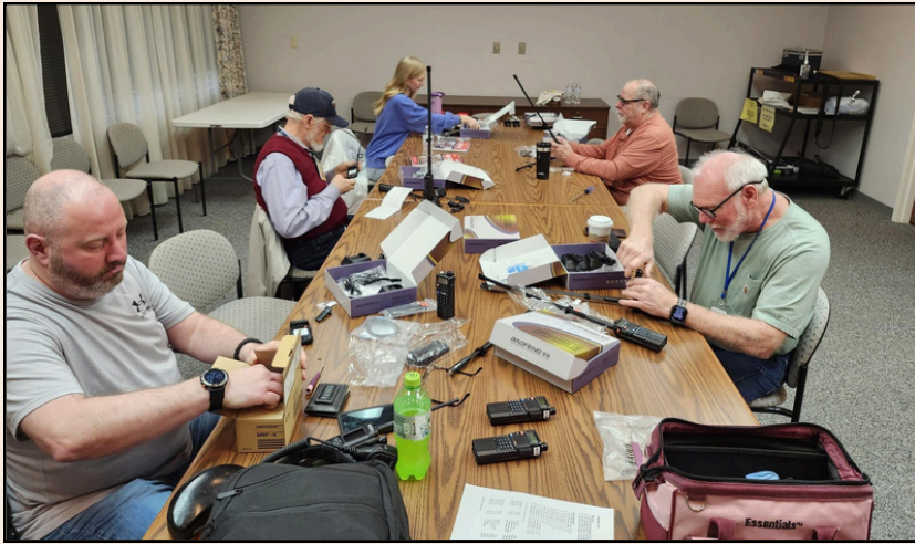
Radio programming party in Washington County.

We are making progress on our amateur radio project. We have started a bi-monthly regional net on the first and third Tuesday of the month. We also have local nets on the second and fourth Tuesdays of each month. A net is like a meeting, but on the radio.