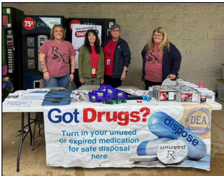
Volunteers in Pennington Gap.