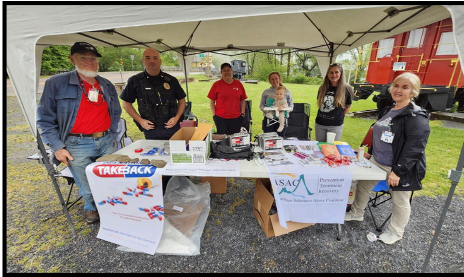
The gang at Drug Take Back in April at the park in Damascus.