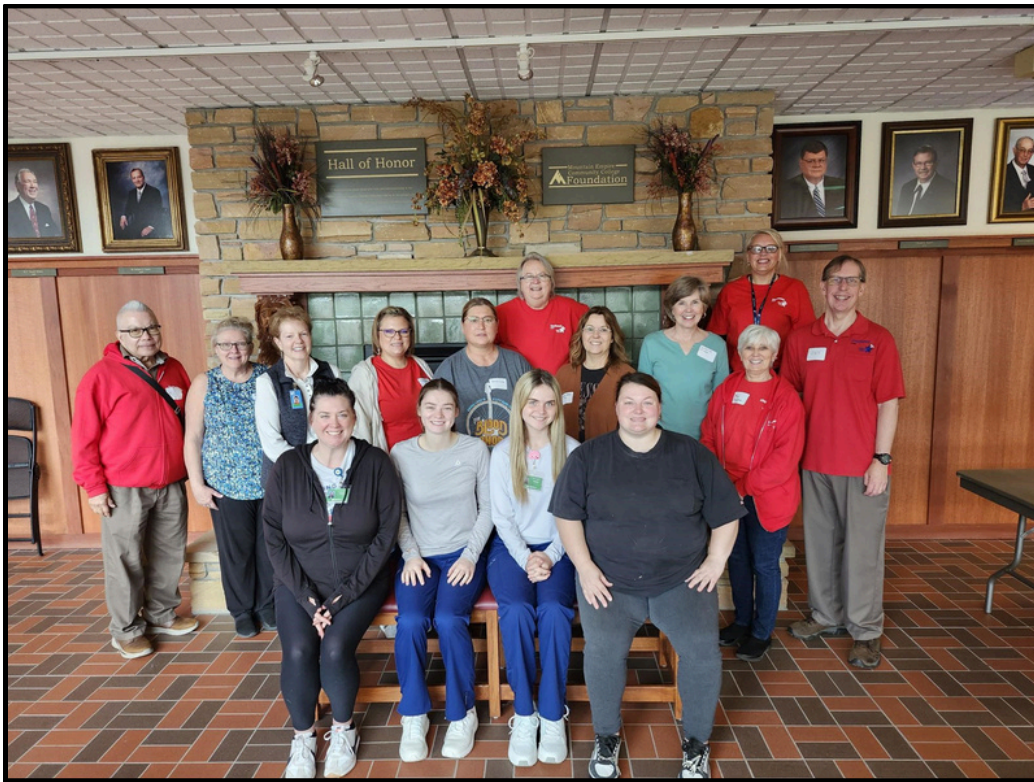
MRC volunteers and students who participated in our training on Nov. 8 th at Mountain Empire Community College