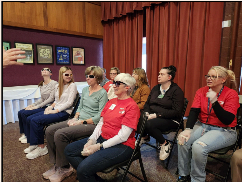
Volunteers and LPN students take part in sensory deprivation exercise at Mountain Empire