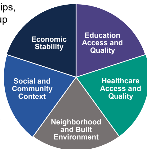
FIGURE 3: Five Key Areas of Social Determinants of Health

Additionally, the strategies were assessed to determine how they addressed social determinants of health. Social determinants of health (SDOH) are the nonmedical factors that influence health outcomes. (5) According to Healthy People 2030, SDOH are all the environmental factors that