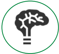
Mental Health and Substance Use

The top three health priority areas were identified through the prioritization process and set the focus for the Community Health Improvement Plan. Mental Health and Substance Use (including nicotine and alcohol) was the most funded health issue with the total of $9,600, followed by Healthcare Access and Quality with $7,000, and then Affordable and Safe Housing with $2,600.