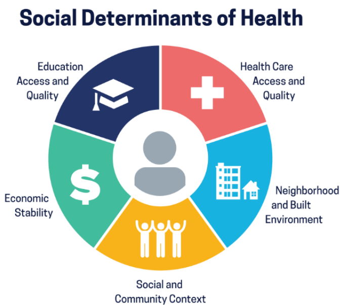
FIGURE 2: Five Key Areas of SDOH Healthy People 2030

Additionally, the strategies were assessed to see if they addressed any social determinants of health. Social determinants of health (SDOH) are the nonmedical factors that influence health outcomes (8). According to Healthy People 2030, SDOH are all the environmental factors that influence your health, including early childhood development, employment opportunities, food insecurity, air and water quality, transportation, educational attainment, public safety, and housing. Figure 2 outlines the five key areas of SDOH (9). It is important to address social determinants of health because these key areas contribute to the health challenges and opportunities that exist in communities.