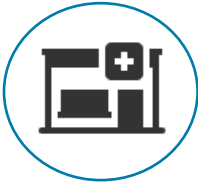
Healthcare Access and Quality