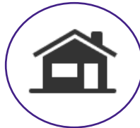
Affordable and Safe Housing